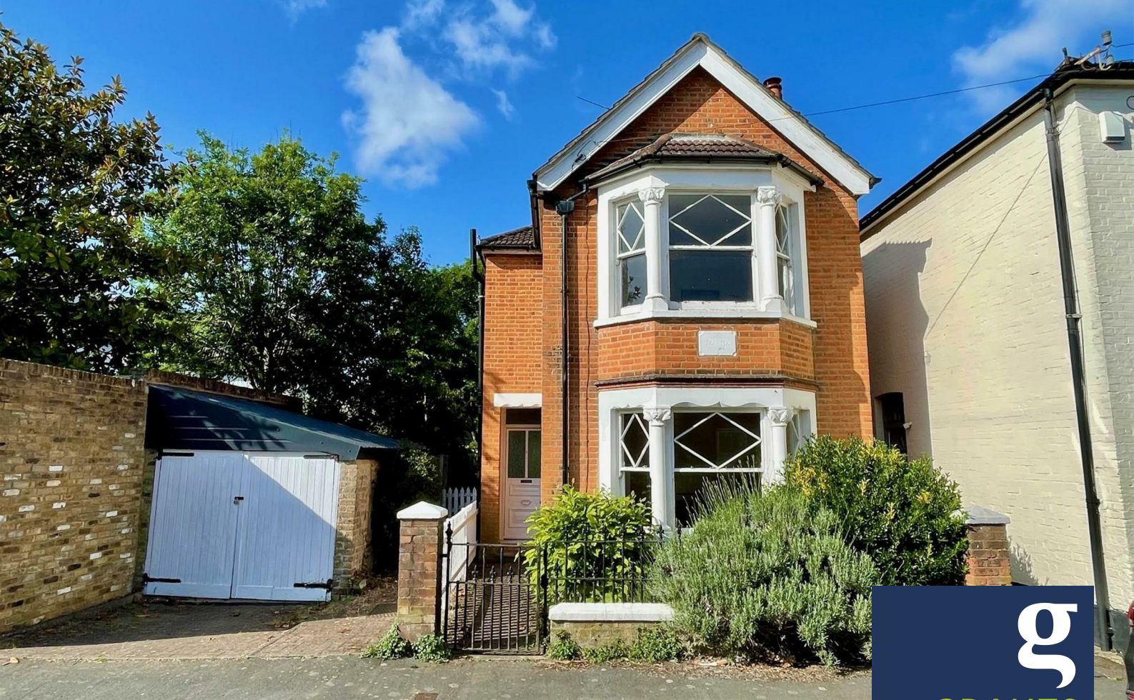
Glencoe Road, Weybridge, KT13 8JY